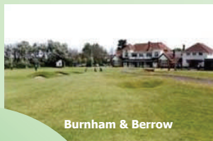
Burnham & Berrow

Like a day out at these courses? Going on holiday? Visiting relatives?